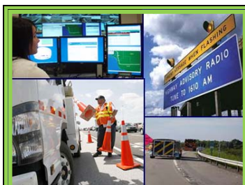
The District One ITS Program uses ITS field components